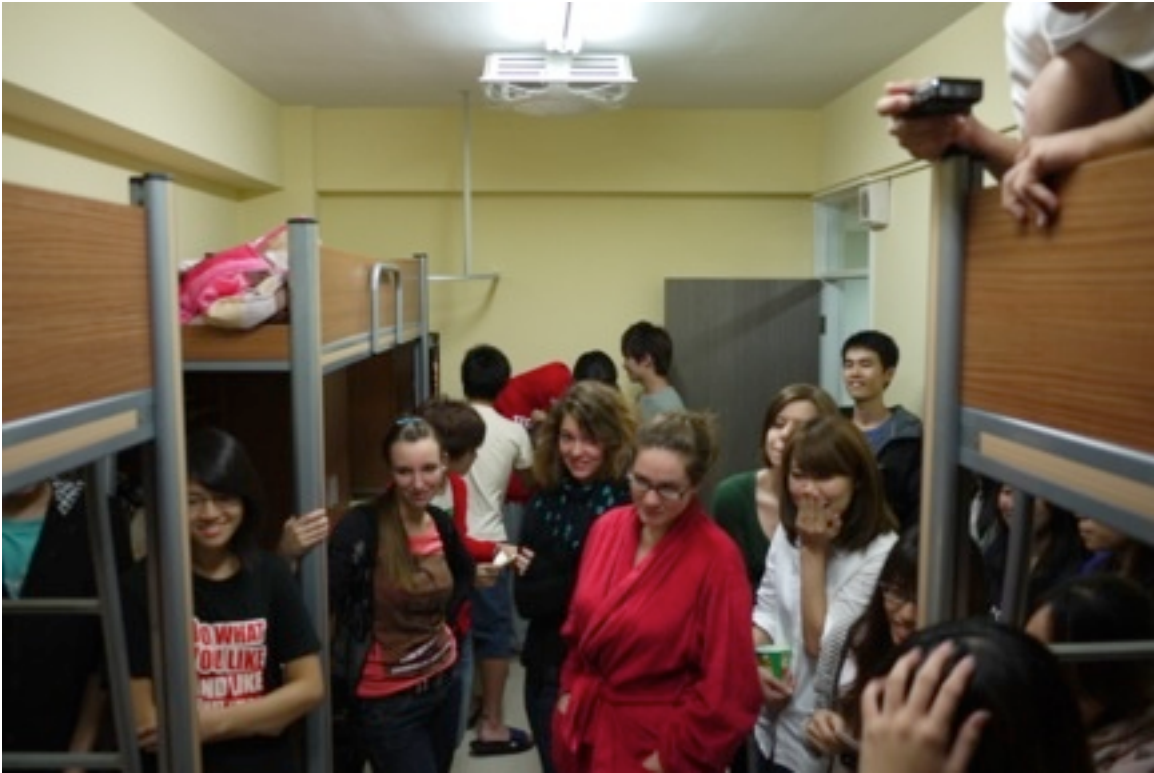
學生經常舉辦生日會，房間內可同時容納十至二十人。 Students hold birthday partys very often, the space inside the room is quite enough for 10-20 persons to stay.